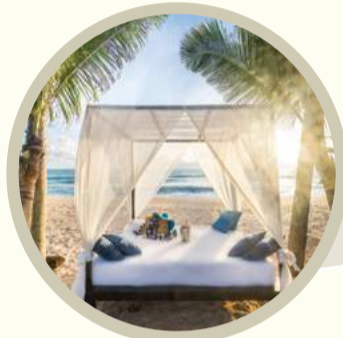
akyra BEACH CLUB PHUKET