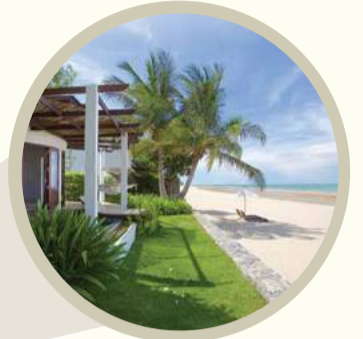
ALEENTA HUA HIN