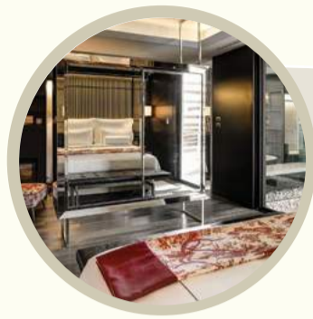
akyra MANOR CHIANG MAI

To help you plan your trip and get the most out of each location we are also offering a choice of signature experiences at special discounted rates. These include spa treatments, cooking classes, photography tours and culture trips – airport transfers are also part of the deal.